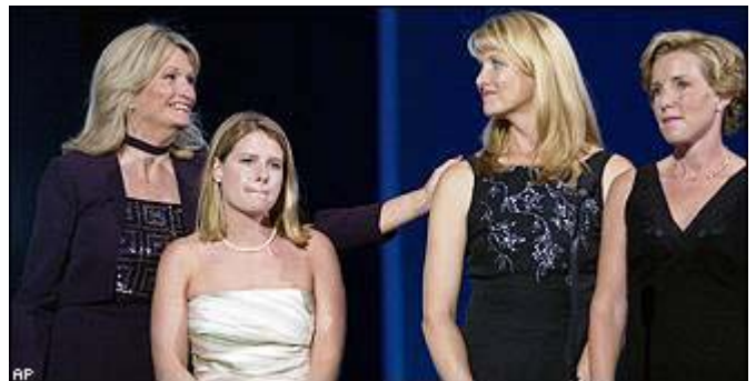
Family of the Flight 93 heroes accept an award.