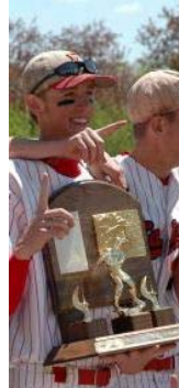
Hall holding 2008 State Championship Trophy