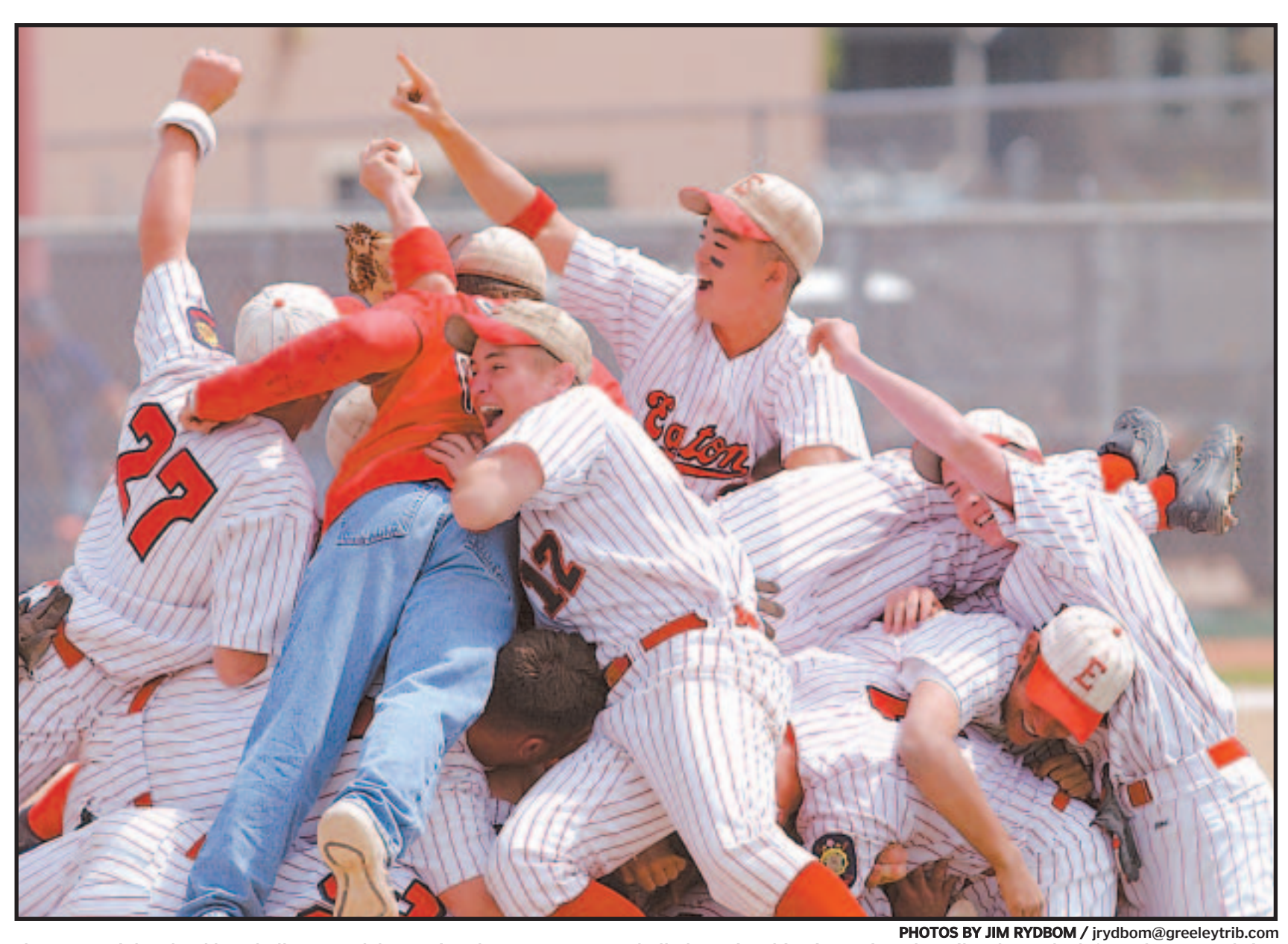
The Eaton High School baseball team celebrates its Class 3A State Baseball Championship victory in a dog pile. The Reds defeated Denver Christian, 12-0, at Denver All-City Stadium on Saturday. This is the second straight year that the Reds have won the 3A state title.